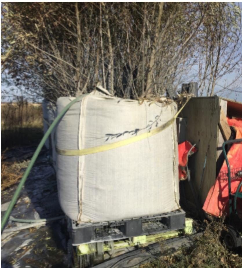
PhAGR®- Phy to A ttached G rowth R eactor